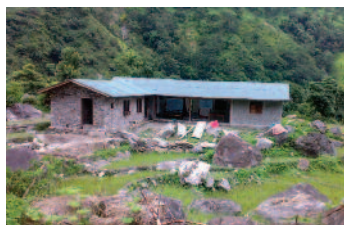
Gola Health Post, July 2011