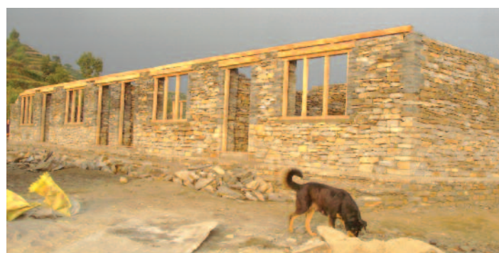
Ever improving 'Bradley Wood' building work in progress