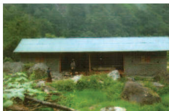
Existing Health Post, Oct 2010

GOLA - following an approach from the villagers CAN agreed to build and staff a Health Post at Gola six days walk from the nearest air strip of the Arun Valley. Currently between 20 and 30 people attend this Health Post daily. The villagers are delighted to have a Health Post and regularly donate pots, pans, food and items of furniture to make the nurses feel welcome and greatly appreciated. With additional support from CAN a small extension is being built to provide separate living accommodation for the nurses.