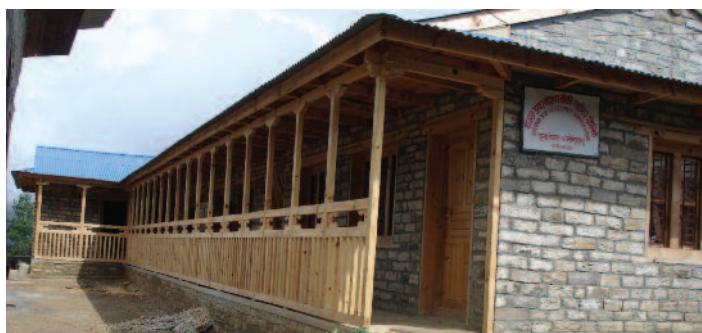
Ghunsa Health Post